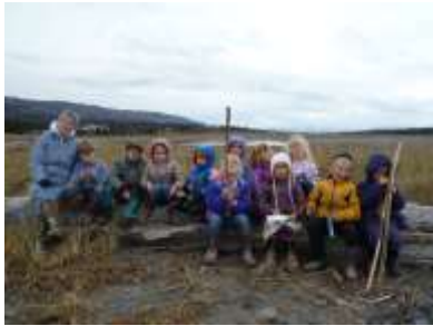
Rocky Shore Explorers